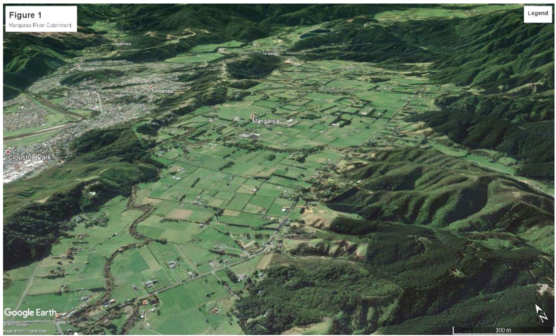
Figure 1: Mangaroa River Catchment.

2.2 As shown in Figure 1 below, the Mangaroa catchment lies to the east of the Hutt River catchment, with the Southern Hills providing topographic separation between the two. The river flows generally in a north-easterly direction through a rural setting, towards its confluence with the Hutt River north of Mt Marua.