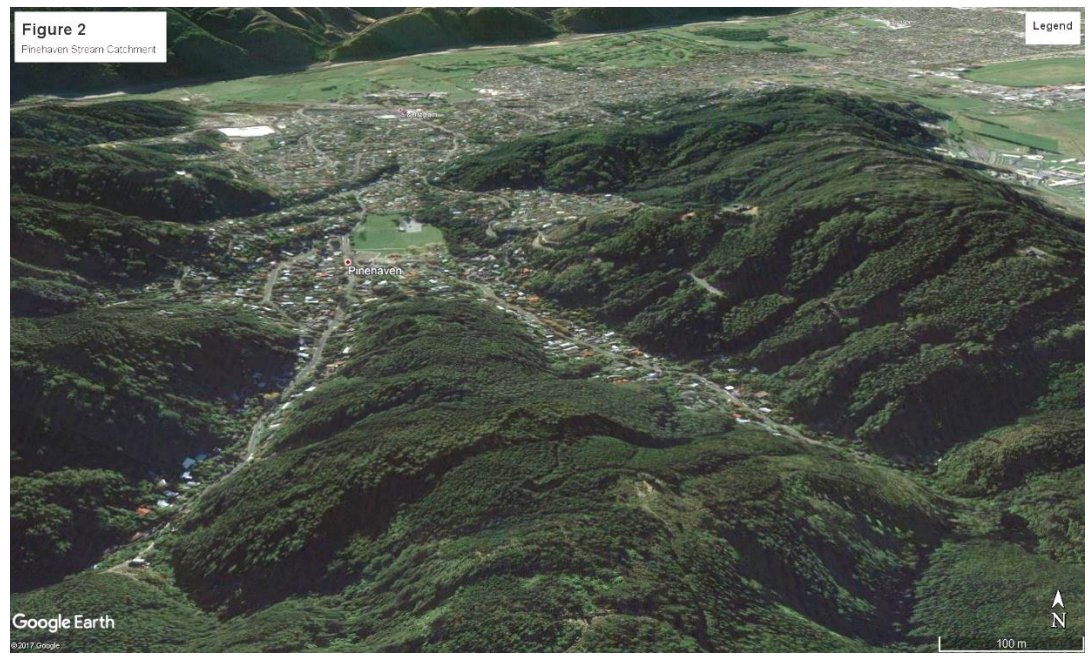
Figure 2: Pinehaven Stream Catchment.

2.5 At 4.5km<sup>2</sup> in area, the Pinehaven Stream catchment ( Figure 2 ) is considerably smaller than the Mangaroa. The stream's upper reaches originate in the steep, pine-covered Pinehaven hills. From there, the main channel and its tributaries flow north through the neighbourhoods of the Pinehaven residential area, under Silverstream village, and eventually into Hulls Creek near Silverstream Railway Station.