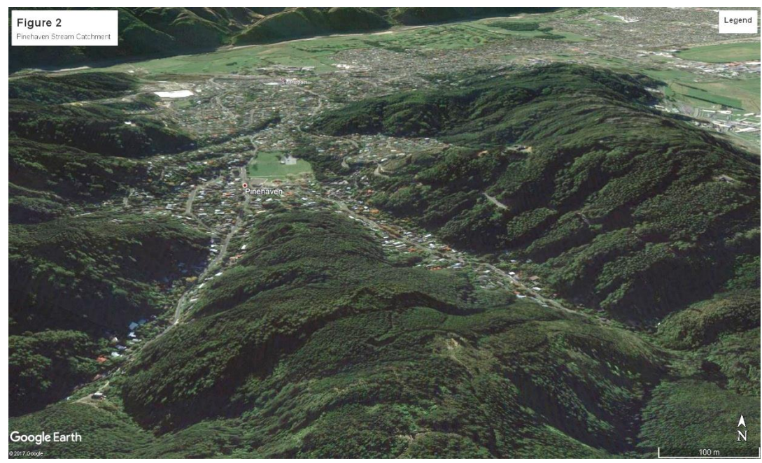
Figure 2: Pinehaven Stream Catchment.

2.5 At 4.5km² in area, the Pinehaven Stream catchment ( Figure 2 ) is considerably smaller than the Mangaroa. The stream's upper reaches originate in the steep, pine-covered Pinehaven hills. From there, the main channel and its tributaries flow north through the neighbourhoods of the Pinehaven residential area, under Silverstream village, and eventually into Hulls Creek near Silverstream Railway Station.